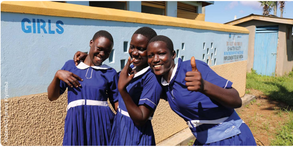
● Three girls stand proudly outside their brightly coloured toilet block at the Opeta school in Pallisa district, Uganda.