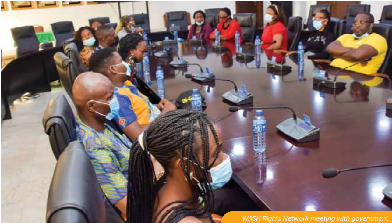
WASH Rights Network meeting with government officials to discuss the Enugu Water Bill