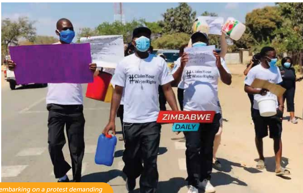
MIHR and NAYO embarking on a protest demanding access to safe water and climate justice