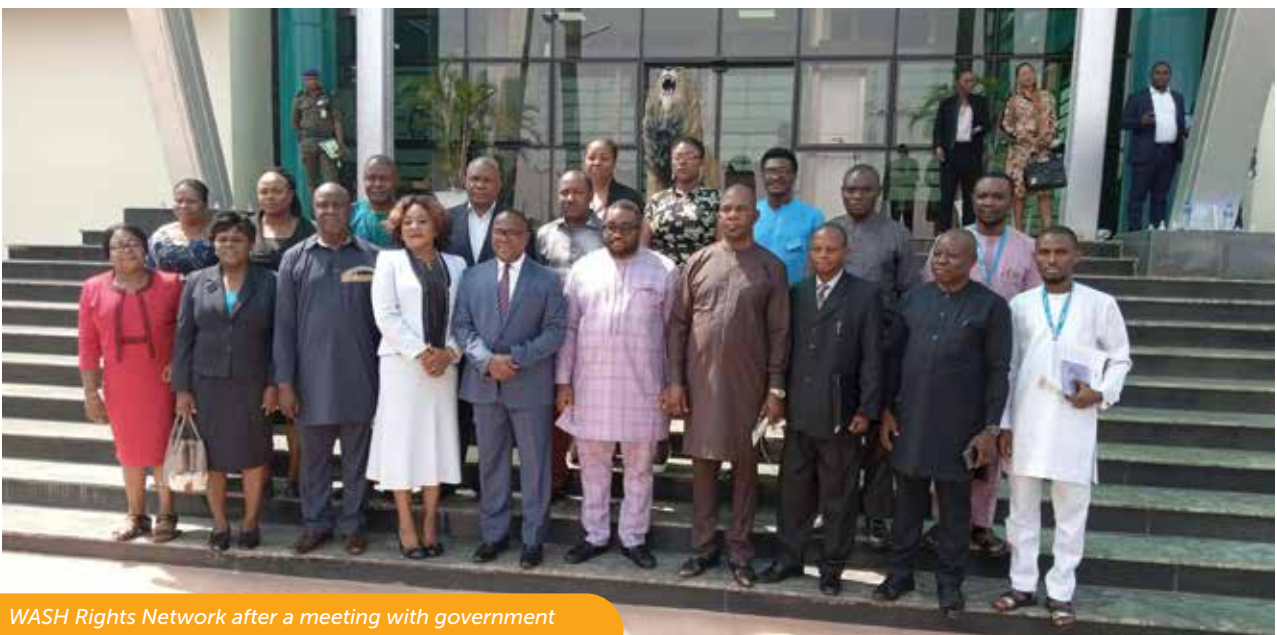
WASH Rights Network after a meeting with government officials, during which the Enugu Water Bill was discussed