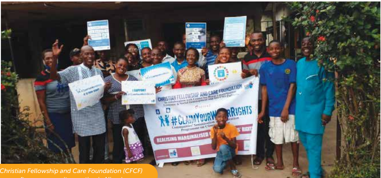
Christian Fellowship and Care Foundation (CFCF) after a community meeting in Nigeria

Other coalition members working under the Claim Your Water Rights banner are integral allies for learning and cooperation. In our 2021-2022 funding agreements, we encouraged members in the same country to jointly coordinate plans and share resources – with the intention of connecting members working at sub-national level with national networks. In most cases this facilitated fruitful collaborations. Many members responded that they were pleased to connect with other End Water Poverty members and see potential in coordinating a shared advocacy agenda.