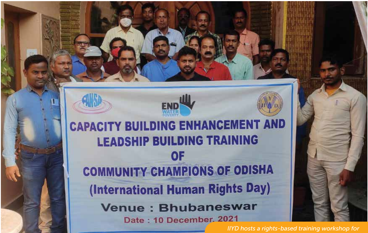
IYD hosts a rights-based training workshop for communities in Bhubaneswar, India (2021)